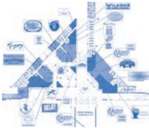
Map of the New Food Court

Until the new gates open, travelers are still boarding their planes at the existing gates in the old concourse A, B and C buildings. All new gates will be phased in, which means as new gates open, the old gates and concourse