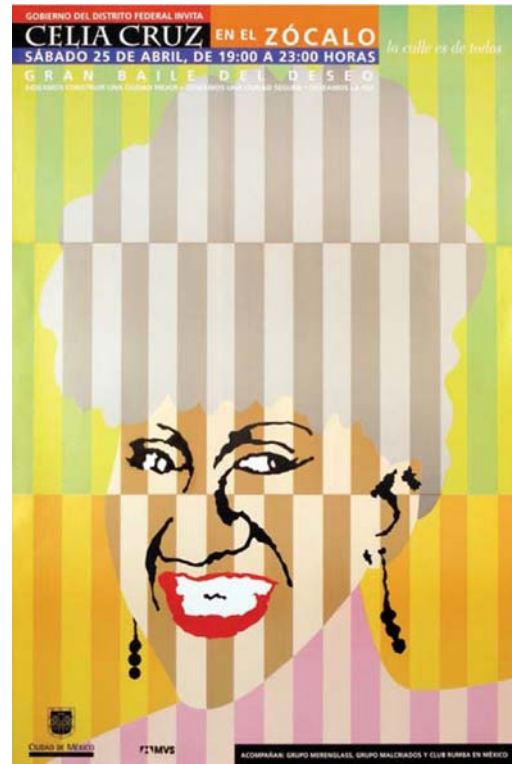
Title: Celia Cruz en el Zocalo Artist: German Montalvo